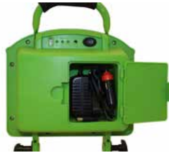
Storage on the reverse for chargers